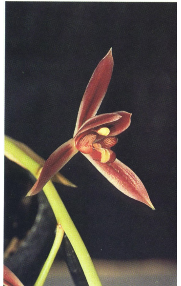
Self pollinates easily