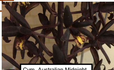
Cym. Australian Midnight