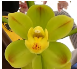
Lemon Sorbet 'Dancer'