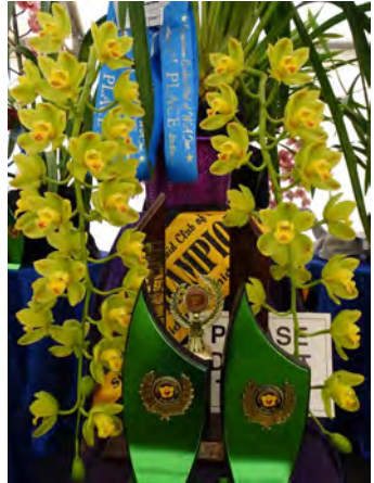
Darch Mustard 'Monte Carlo' at the April Meeting