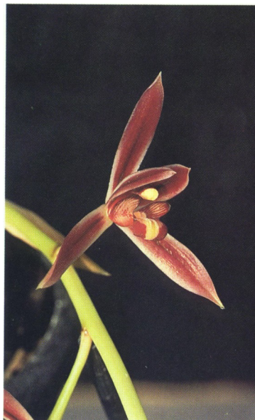
Self pollinates easily