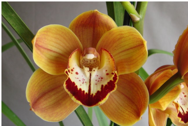
Cym. Drouin Masterpiece 'Tango'

Bring in to the February meeting your gift plants to be seen and for advice.